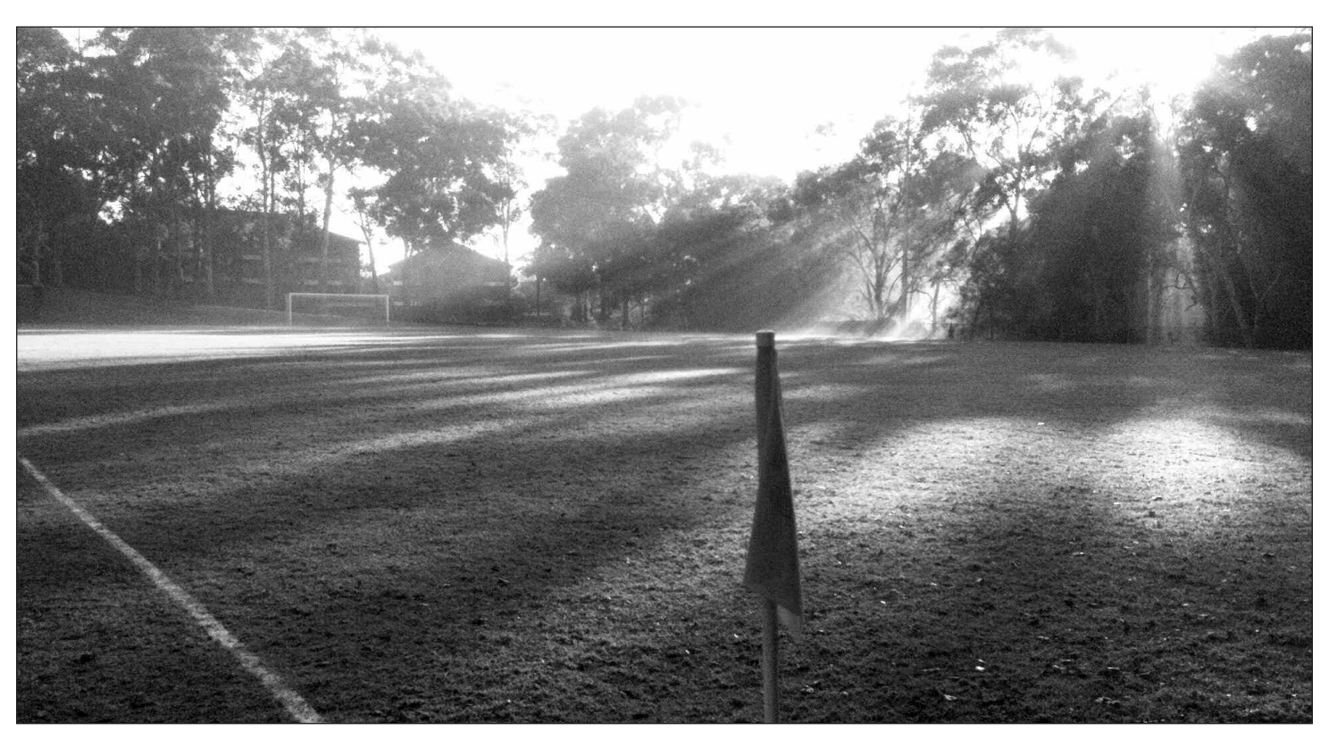
Boronia at 7am